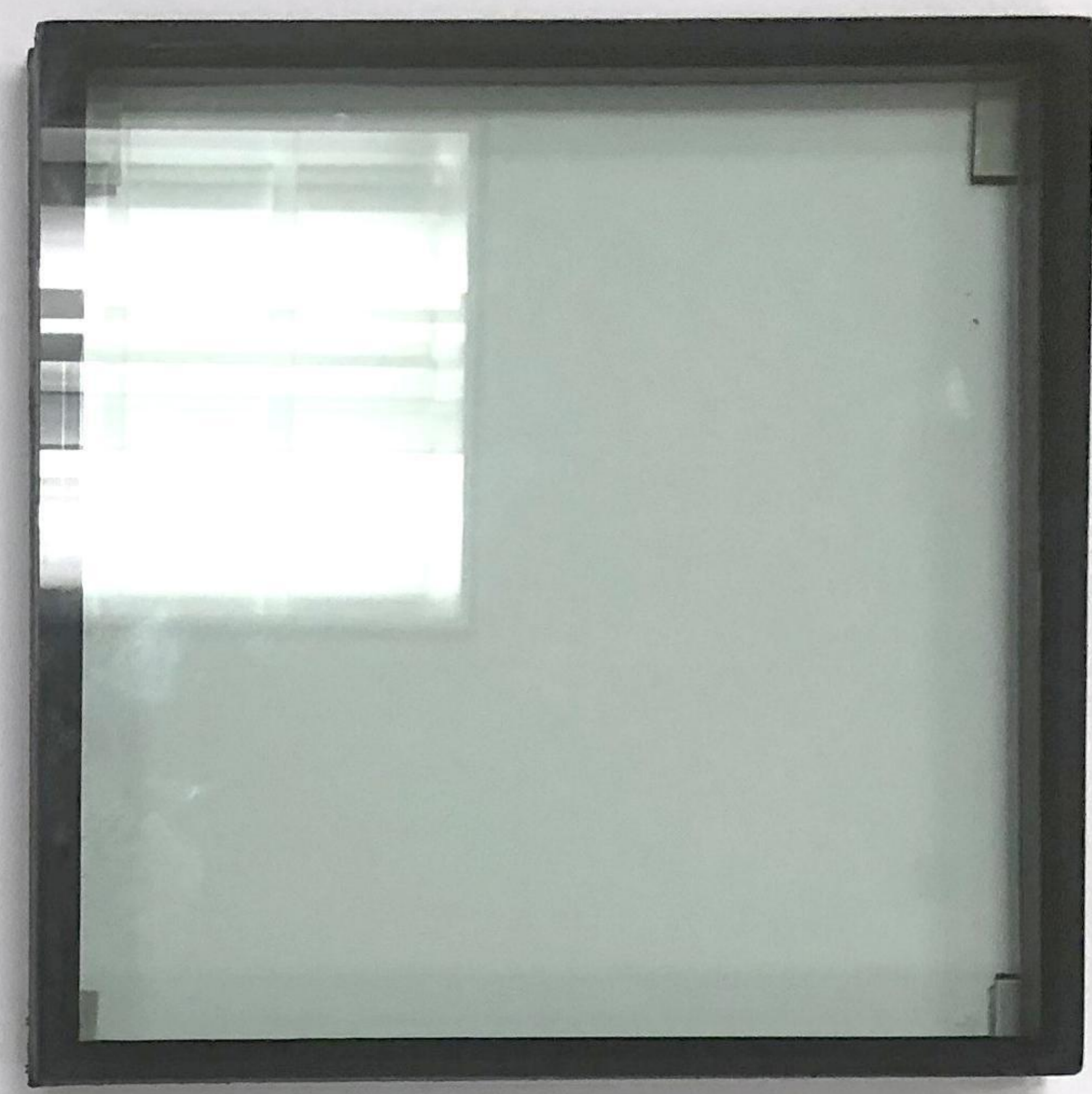
INSULATED GLASS WITH LOW E COATING