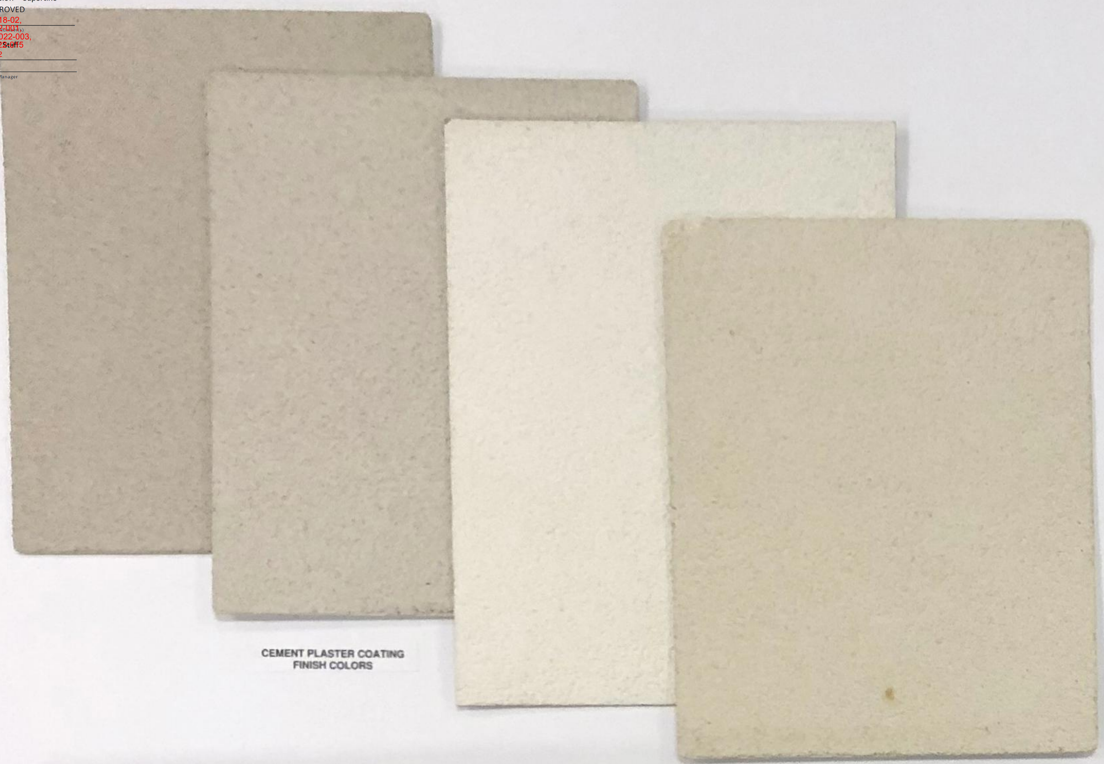
CEMENT PLASTER COATING FINISH COLORS