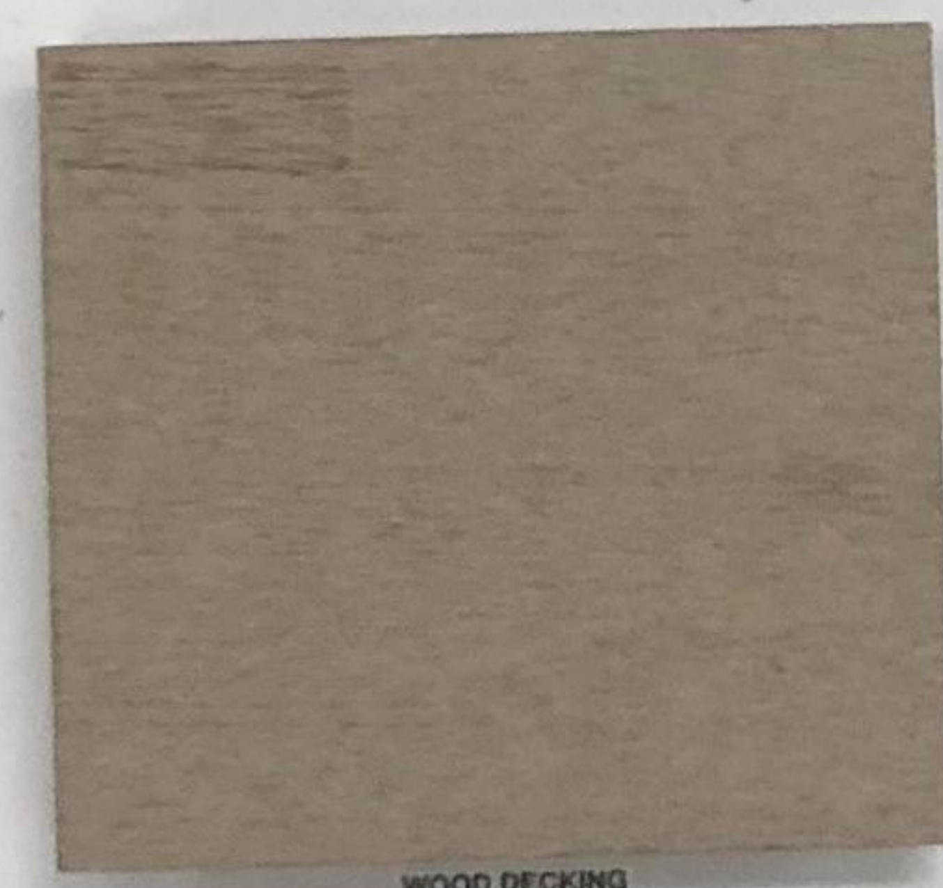
WOOD DECKING COMPOSITE BIO-BASED WOOD SUBSTITUTE (REBYSTA)