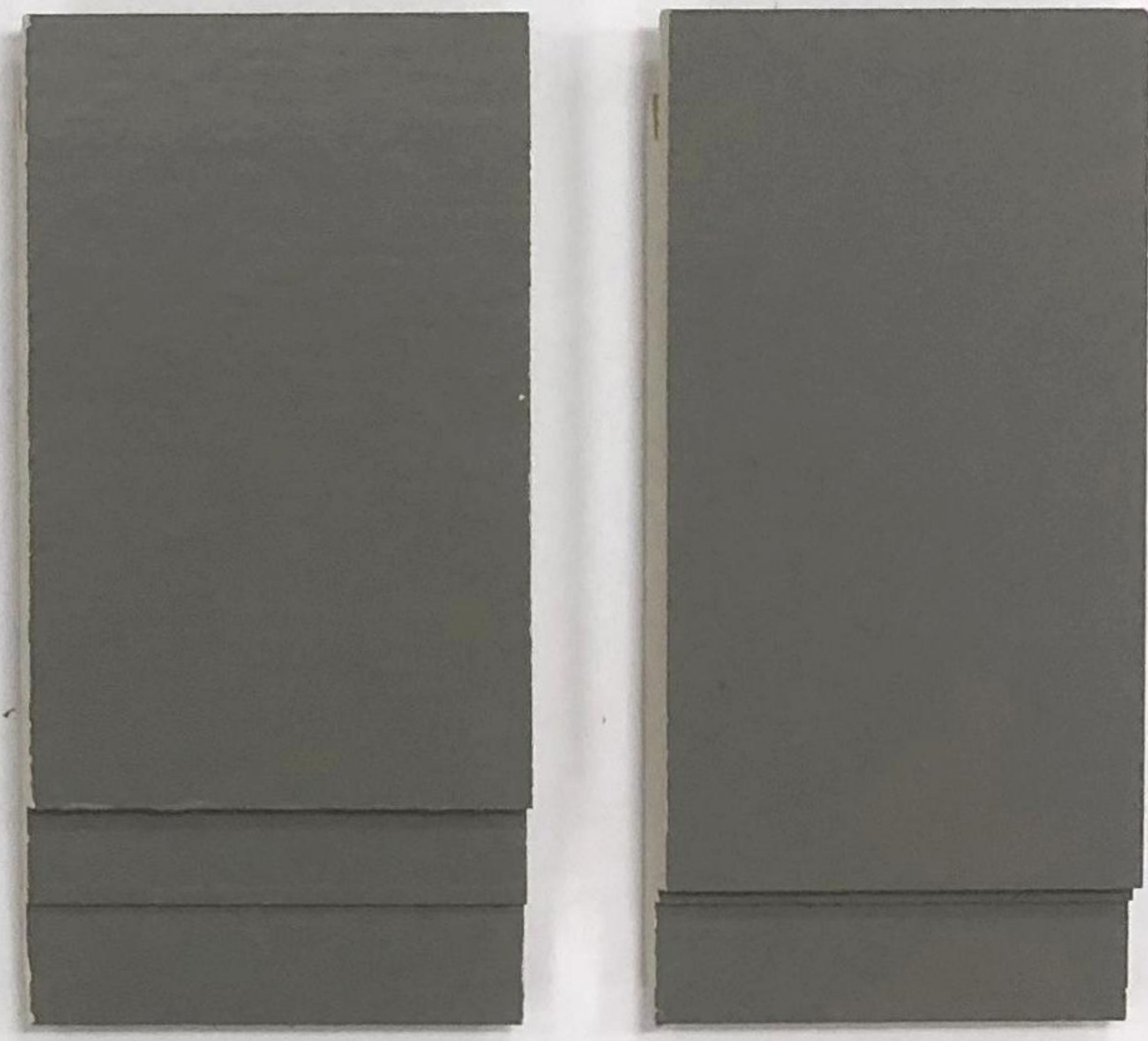
HARDIE BOARD SIDING