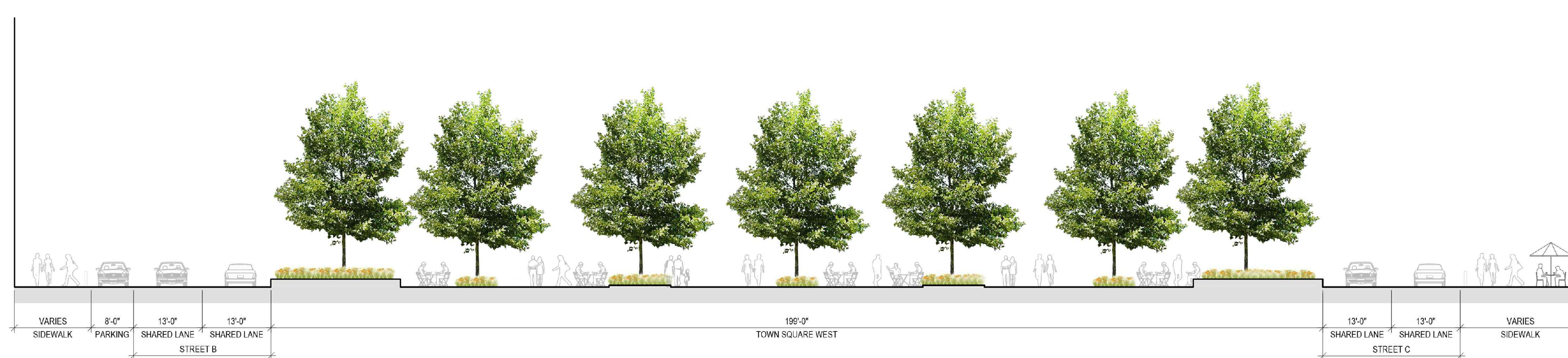
1 | PLAZA WEST SECTION SCALE: 1" = 10'-0"