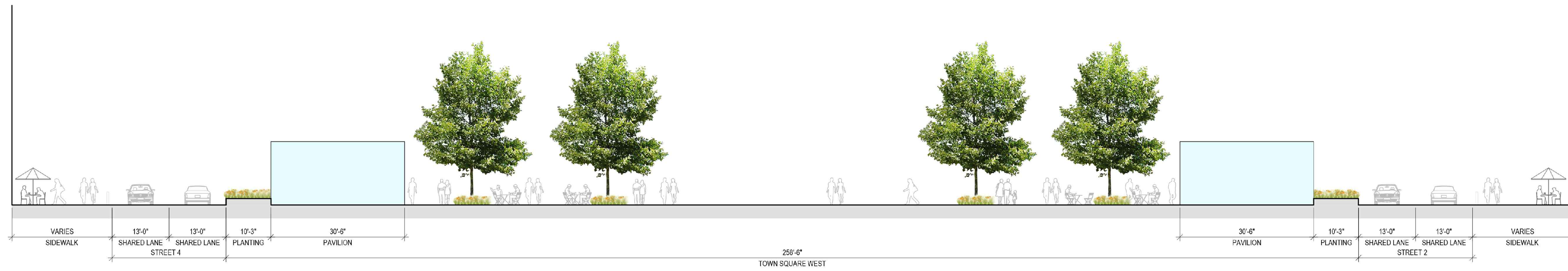
2 | PLAZA WEST SECTION SCALE: 1" = 10'-0"

OWNER - VALCO PROPERTY OWNER LLC 2600 EL CAMINO REAL, SUITE 410, PALO ALTO, CA 94306 T. 650.344.1500 ARCHITECTURE - RAFAEL VINOLY ARCHITECTS 375 PEARL STREET, 31ST FLOOR, NEW YORK, NY 10038 T. 212.924.5050 ARCHITECTURE - RAFAEL VINOLY ARCHITECTS 10125 N. WOLFE ROAD, CUPERTINO, CA 95014 T. 408.627.7990 LANDSCAPE ARCHITECTURE - OLIN PARTNERSHIP LTD. 1817 JOHN F. KENNEDY BLVD, SUITE 1900, PHILADELPHIA, PA 19103 T. 214.440.0030 CIVIL - SANDIS CIVIL ENGINEERS SURVEYORS PLANNERS, INC. 1700 S. WINCHESTER BLVD, SUITE 200, CAMPBELL, CA 95008 T. 408.636.0500 TRAFFIC - KIMLEY-HORN AND ASSOCIATES, INC. 100 W. SAN FERNANDO STREET, SUITE 230, SAN JOSE, CA 95113 T. 669.800.4130 LIGHTING DESIGN - ONE LUX STUDIO 156 WEST 29TH STREET, 10TH FLOOR, NEW YORK, NY 10001 T. 212.201.5750 SIGNAGE & WAYFINDING - EXIT DESIGN 725 N. 4TH STREET, PHILADELPHIA, PA 19123 T. 215.561.1550 PARKING ENGINEERING - WATRY DESIGN, INC. 2099 GATEWAY PLACE, SUITE 550, SAN JOSE, CA 95110 T. 408.392.7900 FOOD SERVICE, WASTE MANAGEMENT & LOGISTICS - CN-LITTLE 156 2ND STREET, SAN FRANCISCO, CA 94105 T. 415.922.9900